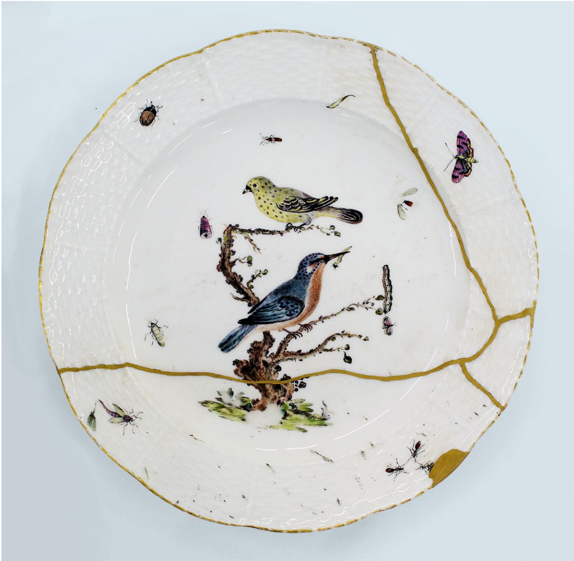
6—Plate with bird decoration, porcelain, Meissen, c. 1760

Restituted by the Dresden Porcelain Collection to the descendants of Gustav von Klemperer in 2010, since 2010 Edmund de Waal Collection, London